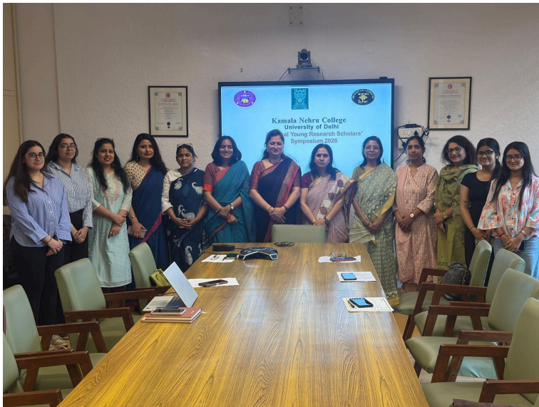
EVENT: EVENT: NYRSS 2026 SYMPOSIUM: Inquiry and Insights: Research perspectives in contemporary contexts (24-04-2026)