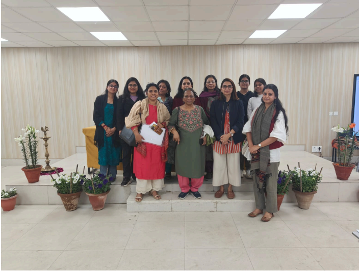
EVENT: Ethics in Research: Guide for Undergraduate Researchers